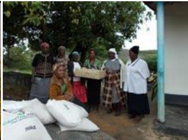
Keeping chickens - diversifying