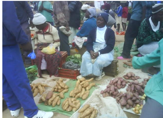
Hard working women at the market-Domboshava.

At the market I met so many amazing hard working rural women who changed my perception of life. I just wanted to spend more time with them talking, bonding and trying to understand how they were so cheerful, resilient and kept it moving under their own circumstances. They were even better than most of us in the city because they had readily available cash and they circulated it amongst themselves selling. Even though they had limited food choices they were healthy and strong, one problem though is for all the hard work they did not make good money. The vegetables they sold were flooded on the market bring the price down and sometimes the leftovers from their sale would have to be tossed away. That really broke my heart considering how much the city women who bought the vegetables for resale were making (over 100% more). The Domboshava Showground market is about 30 miles from Harare. The women from Harare travelled daily to buy vegetables to sell in the city, making much more than the rural women and they worked the hardest.