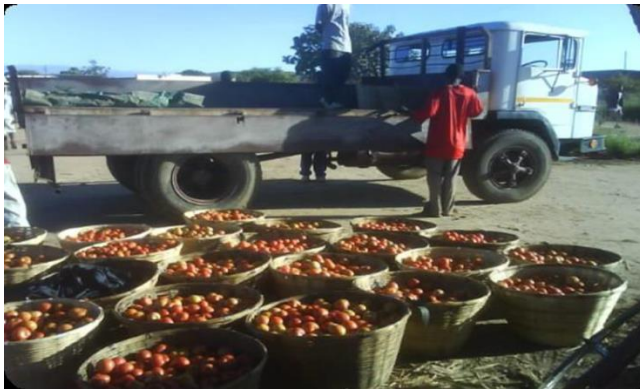
Tomatoes are the backbone of Domboshava

The Domboshava community project was not a planned or well thought out idea at the beginning but arose from a place of desperation which called for desperate measures. 2008 was a very challenging time for all in Zimbabwe where the economy took tremendous knocks and shelves in the shops were empty. Cash was difficult to get from the banks because of inflation. Faced with a problem of trying to fix a broken borehole which required $50.00 USD, I had to come up with a plan, my husband had just left for Rutgers University to teach summer school. The person who was going to fix the borehole gave me an idea to sell my children's used clothes because there was a huge demand for them at Domboshava showground market; to raise the needed cash for the repairs. The banks could only give out $100 Zimbabwean dollars a day (enough to buy a loaf of bread) which meant standing in a line every day for however long it was going to be, to raise the equivalent of the US dollars.