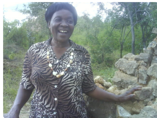
Sylvia's Mother in 2009