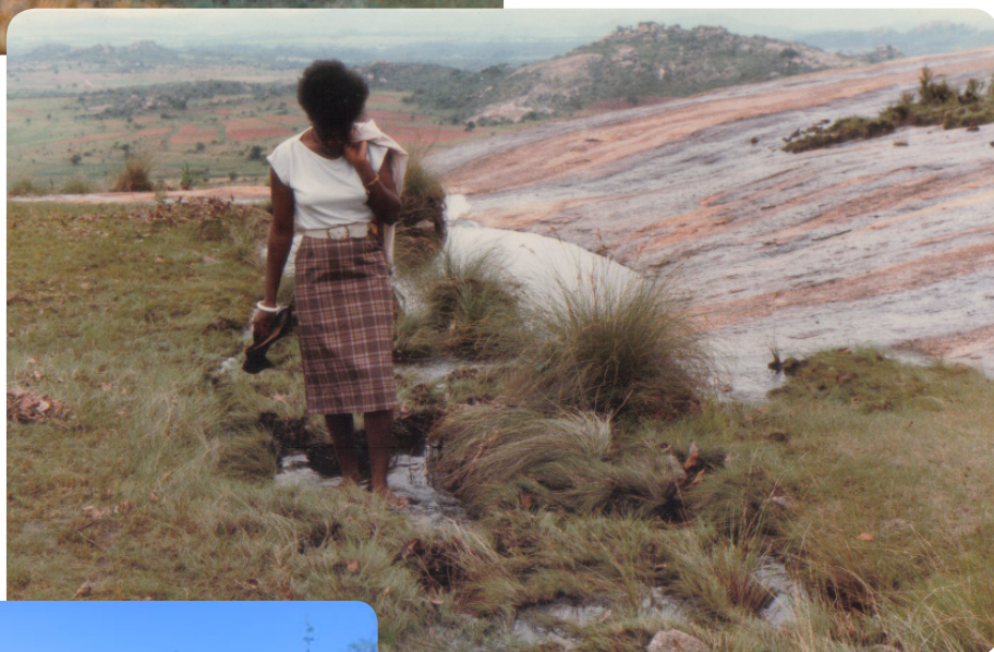
Sylvia Mushonga Domboshava Caves 1985