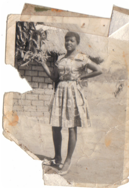
My mother at age 17 at her homestead in Shamu Village